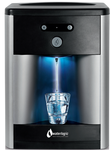
WL350 Countertop Model

The Firewall™ technology has been tested and certified by the Water Quality Association to NSF/ANSI-55 Class A UV and NSF/P231 US EPA standard for microbiological water